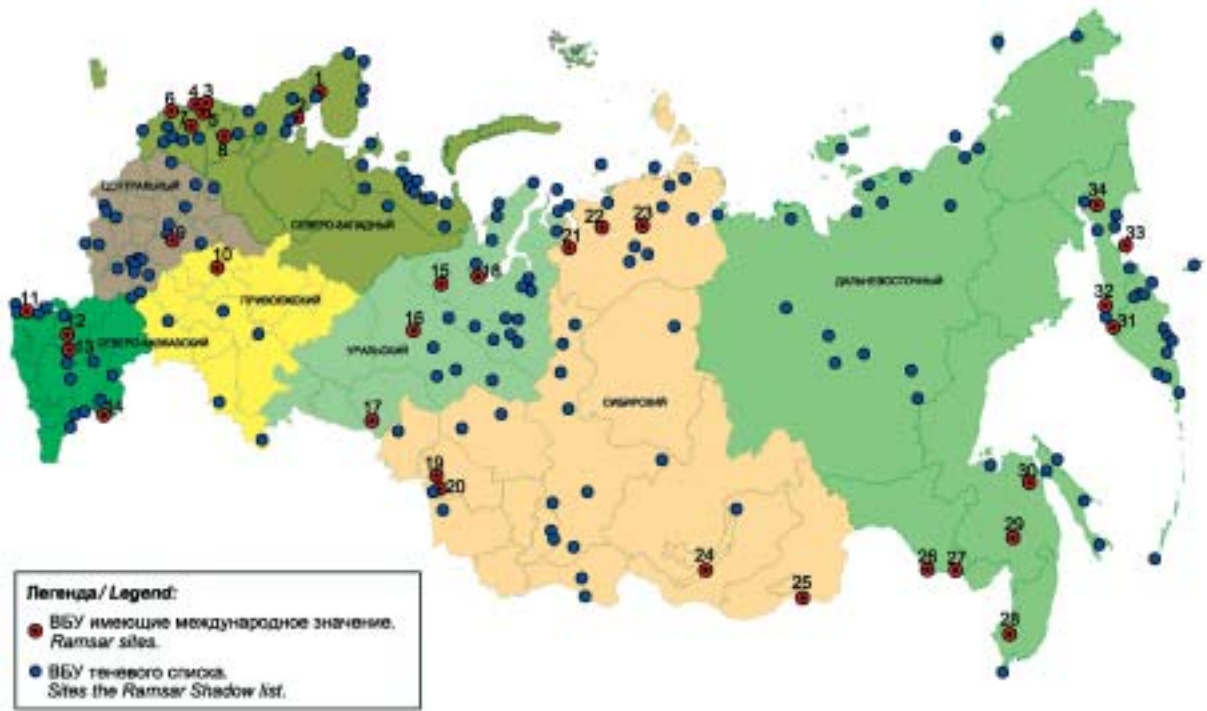
Figure 5. Most valuable wetlands in Russia.