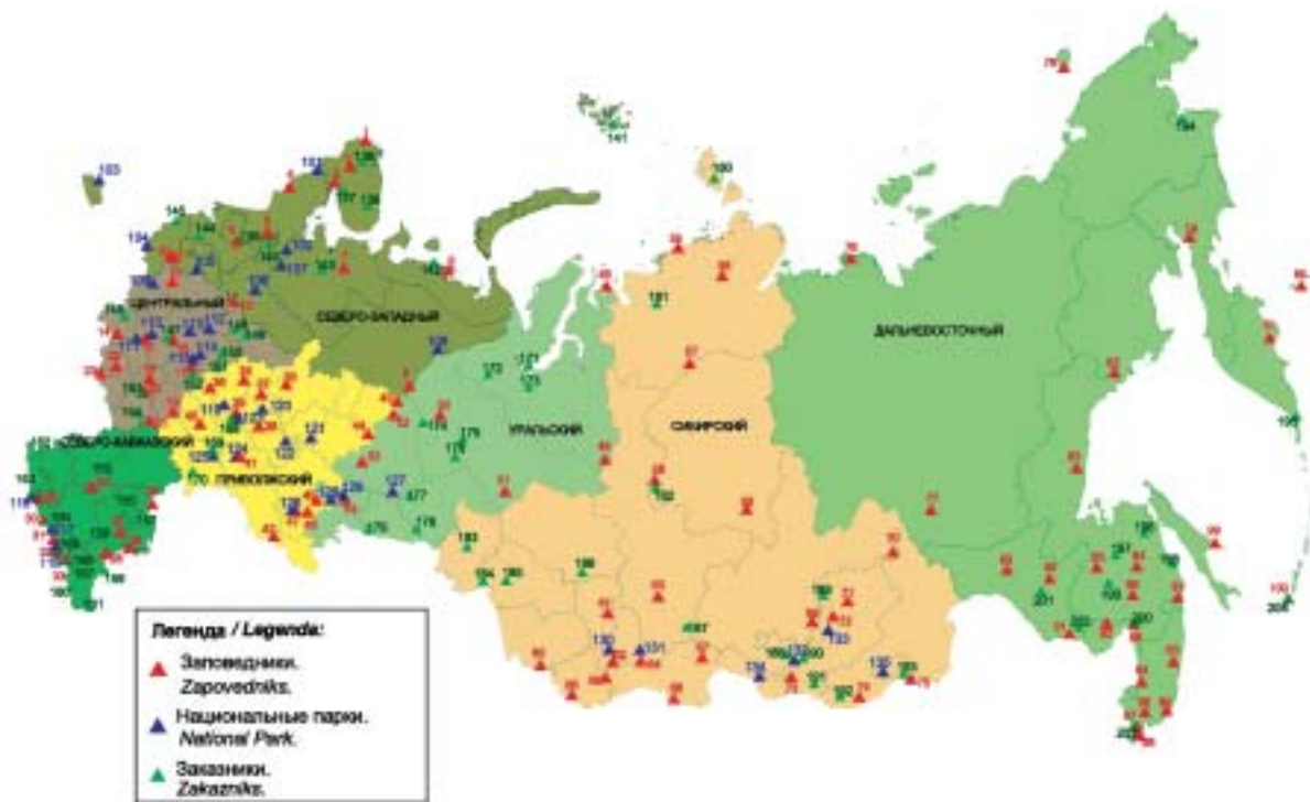
Figure 3. Federal specially protected natural areas in Russia.