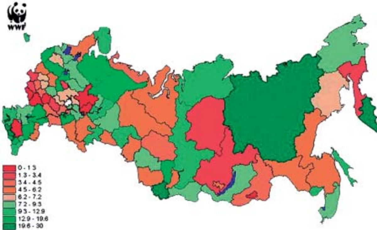
Figure 1. Share of protected areas in total square of regions in Russia.