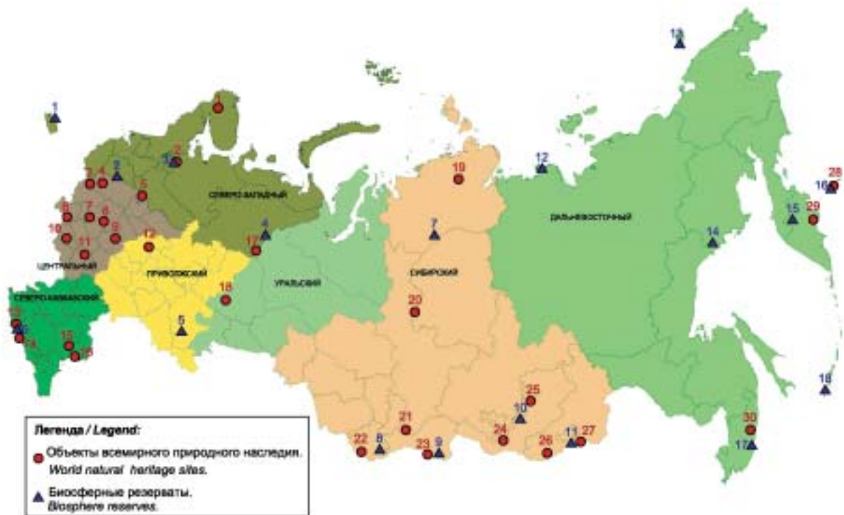
Figure 6. World heritage sites and biosphere reserves in Russia.